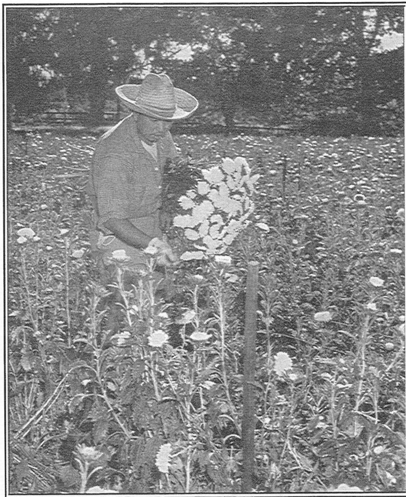
Exhibit Open Through March 1998

Cupertino History Museum Quinlan Community Center 10185 N. Stelling Road Cupertino, CA 95014 408/973-1495